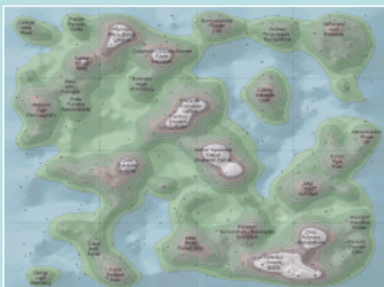
Patent study showing where MEMS patents are being issued